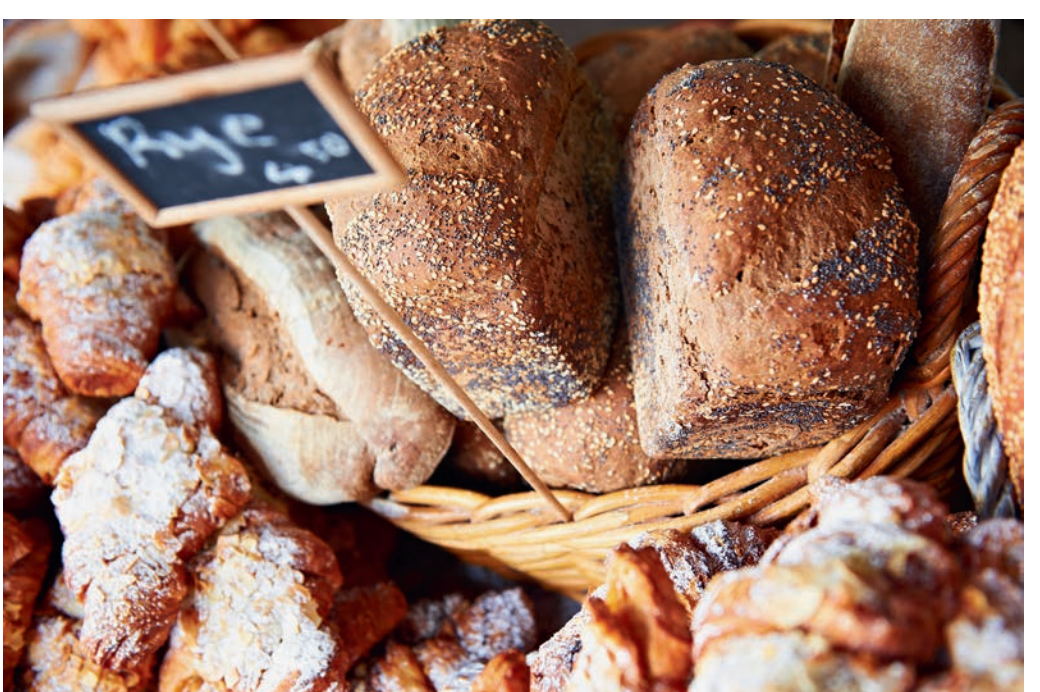
Fresh produce at the Margaret River Farmers' Market.