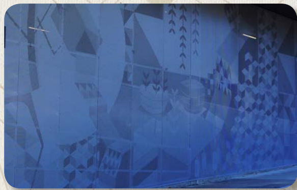
1008 Hay Street, Perth