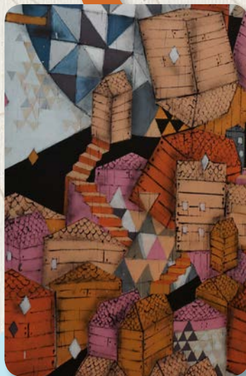
Somerset House Reception, 185 St Georges Tce, Perth