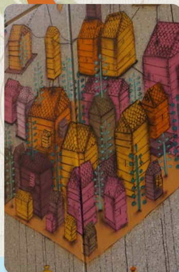
140 William Street