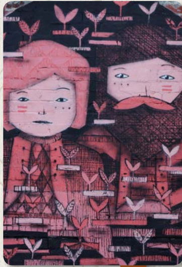
Wilson Street Outdoor Carpark, Murray Street, Perth