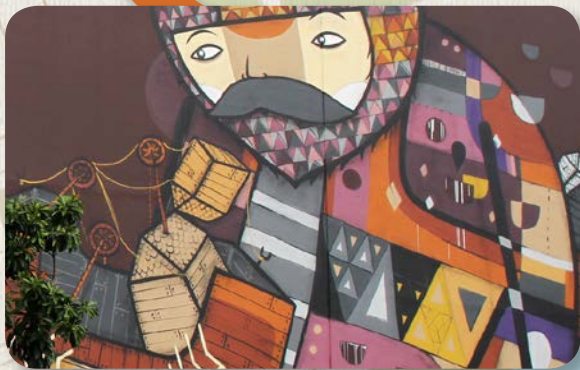
Behind the Claremont Post Office opposite the train station