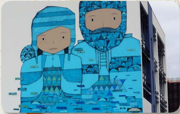
50 Oxford Place West Leederville