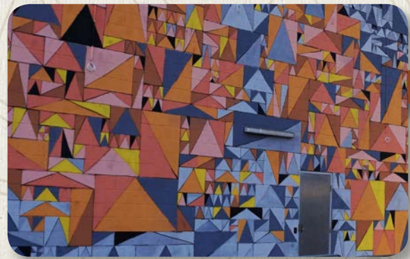
Cogen Building between Terminal 1 & 2 at the Airport