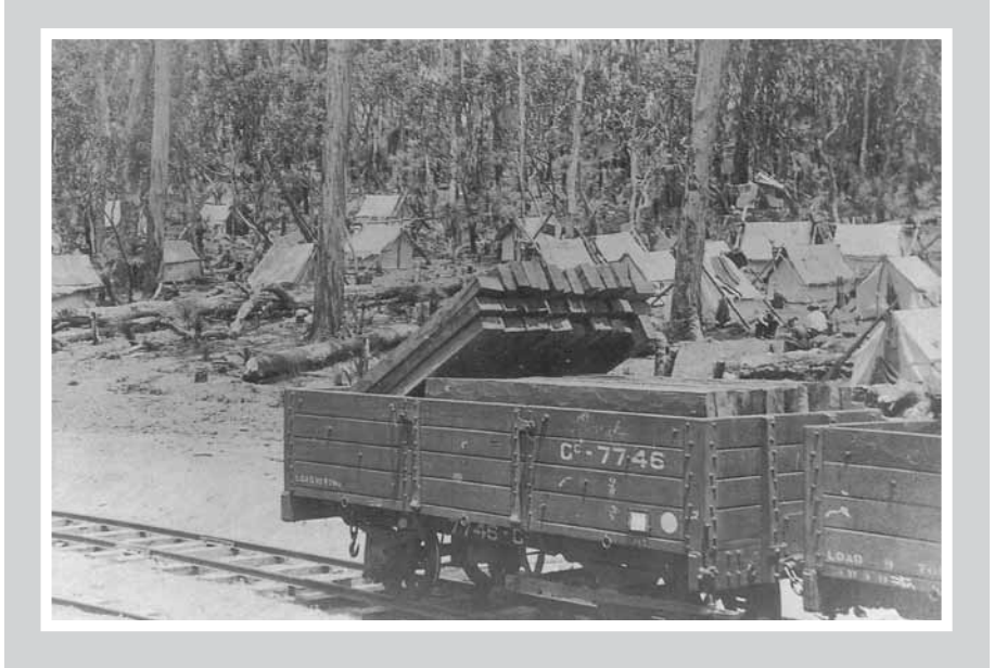
A typical sleeper-hewers' camp in south-west Western Australia, c. 1914.

Australia was reasonably well informed about international events. Recently completed undersea cables allowed transmission of telegraphed news stories from Europe, and the capital city daily newspapers could have up to date information within a day or so of its appearance overseas. Scores of local newspapers in the bush towns, avidly read in the absence of other communication media, picked up such stories as well. Most Australians were therefore aware of the international tensions that had been building in Europe in previous years, and of the bellicose attitudes of Germany and Austria towards their neighbours. They had noted the crisis resulting from the assassination of Archduke Franz Ferdinand of Austria by a Serbian extremist on 28 June 1914. Nevertheless, it was only in the last few days before these events reached their climax that it began to dawn on the British peoples that they were about to become involved in a major war.<sup>14</sup> On 4 August, faithful to her formal and informal alliances, Great Britain declared war on