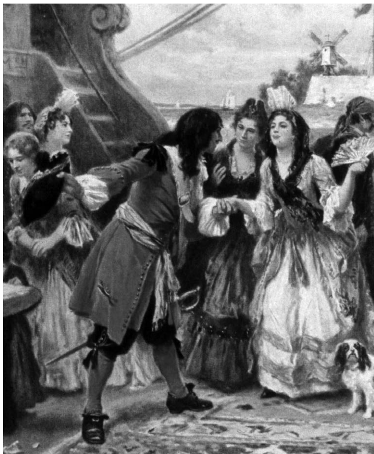
'Captain Kidd in New York Harbor'.

From a painting by Jean Leon Gerome Ferris (1863–1930).